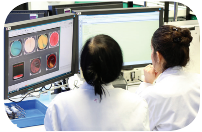
Microbiology department at Northwick Park Hospital

We regularly promote staff within the organisation and staff are encouraged and supported to progress in this way. There are opportunities to engage in research projects, we currently have approximately 110 projects across our Microbiology departments and over 1000 projects across the organisation.